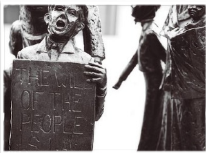
'The will of the people is law'

What is good and pleasing to him? The answer according to 1 Tim 2:4 "that all people should be saved and that they come to know the truth in Christ." Salvation, that is the core message of the Gospel. - How can we support this good will of God? Paul does not say "go and evangelise", but create the political framework for the gospel: a "peaceful and quiet life ... marked by godliness and dignity." What is meant is a socially satisfied society in which religious freedom and human dignity prevails (in today's language). For this to happen, we must pray (V2a) for the decision-makers in the state – at that time the kings, today the democratically elected politicians. Since democracy as a form of state obviously guarantees the best conditions for the gospel worldwide, let us work and pray for its preservation in Europe. "Because this is good and pleasing to God."